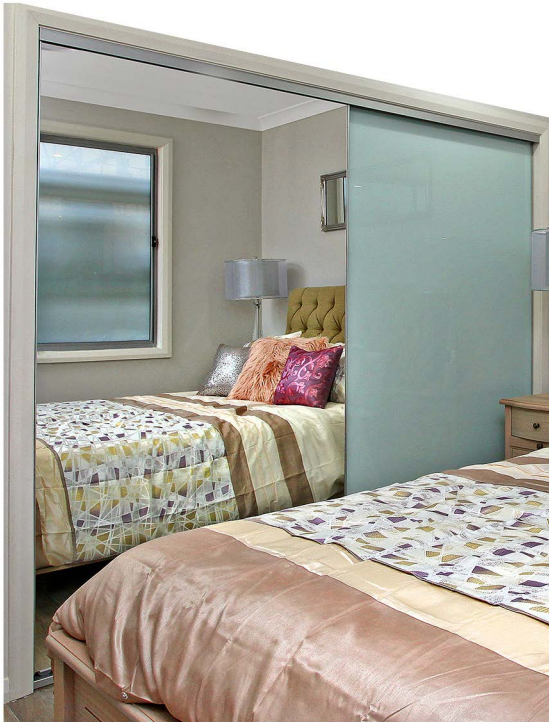
Semi Framed Sliding Wardrobe doors