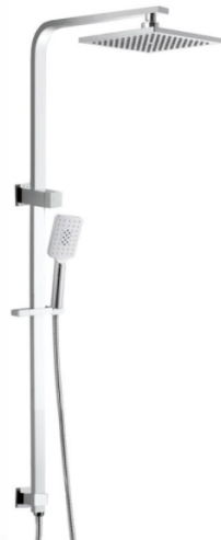
Multi Functional Shower head