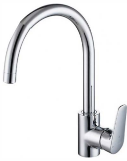
Gooseneck Mixer for Kitchen sink