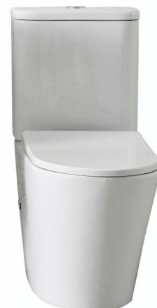
Back to wall toilet suite

Disclaimer: The Bathla Group reserves the right to amend prices and specifications without prior notice or obligation. The inclusions are current at time of printing but subject to change depending on availability.