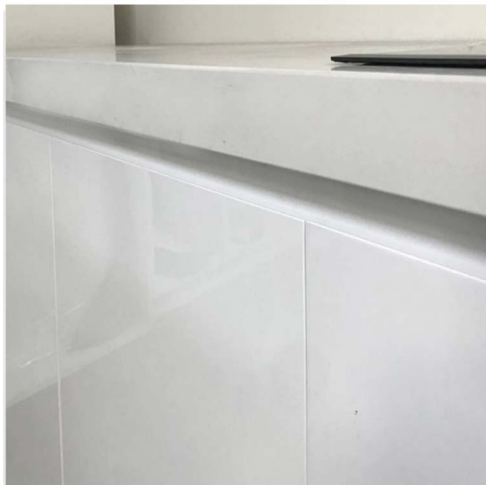
40mm Stone Benchtop