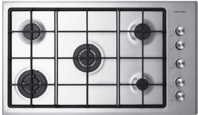
FISHER & PAYKEL CG905CNGX2