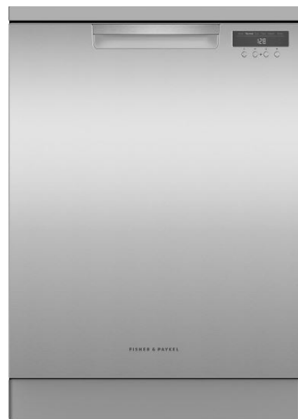
FISHER & PAYKEL DW60FC1X1

Disclaimer: The Bathla Group reserves the right to amend prices and specifications without prior notice or obligation. The inclusions are current at time of printing but subject to change depending on availability.