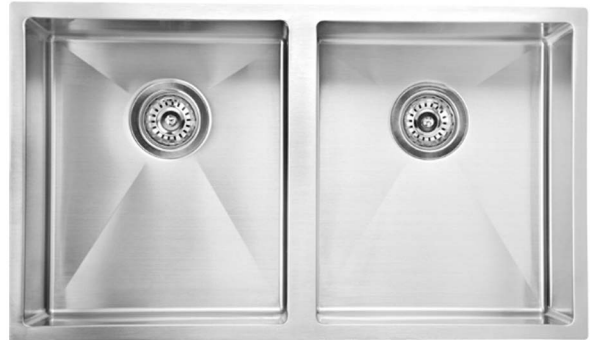
Double bowl Square Sink