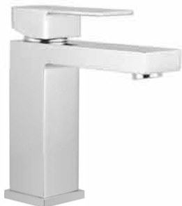
Bathroom Sink Mixer