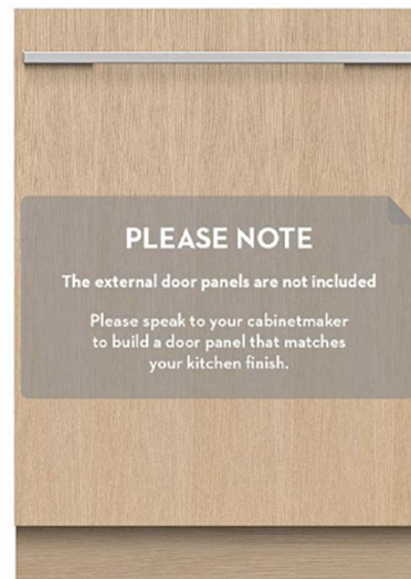
Fisher & Paykel DW60U2I1