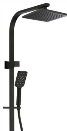
Adjustable Height Shower head