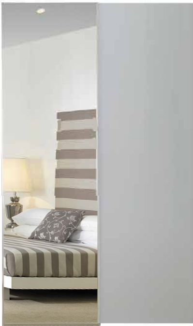
Frameless Sliding Wardrobe doors