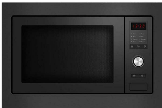
Fisher & Paykel OM25BLSB1