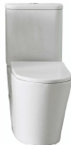
Back to wall toilet suite

Disclaimer: The Bathla Group reserves the right to amend prices and specifications without prior notice or obligation. The inclusions are current at time of printing but subject to change depending on availability.