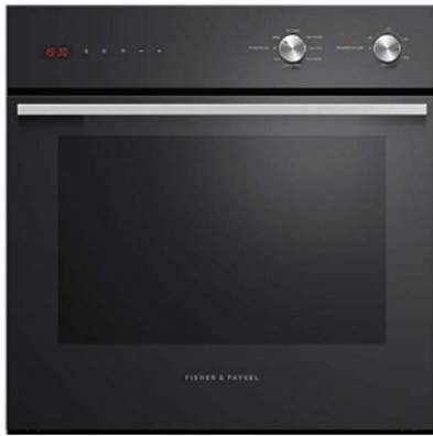
Fisher & Paykel OB60SC7LEB1