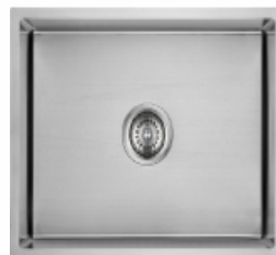
Drop in Laundry sink

Disclaimer: The Bathla Group reserves the right to amend prices and specifications without prior notice or obligation. The inclusions are current at time of printing but subject to change depending on availability.