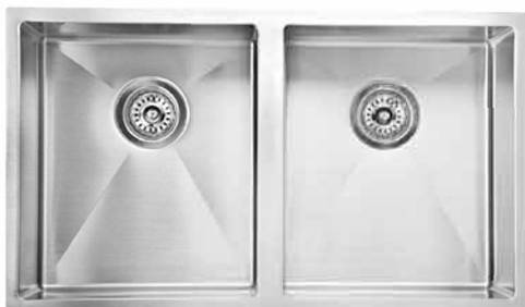
Double bowl Square Sink