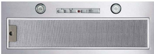
Fisher & Paykel HP90ICSX3