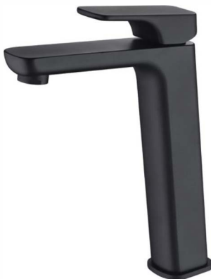
Matt Black Basin Mixer