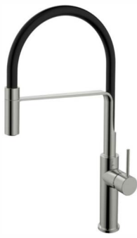
Veggie Mixer for Kitchen sink