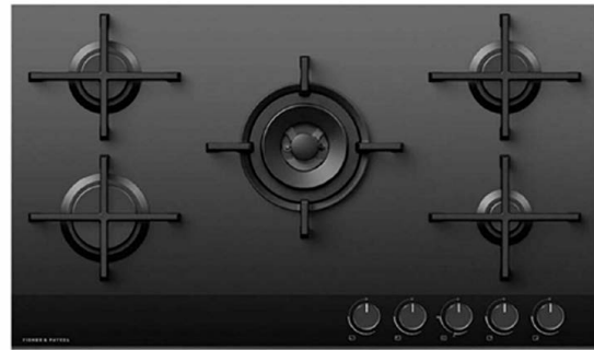
Fisher & Paykel CG905DNGGB4